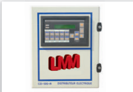
Control Panel [optional]