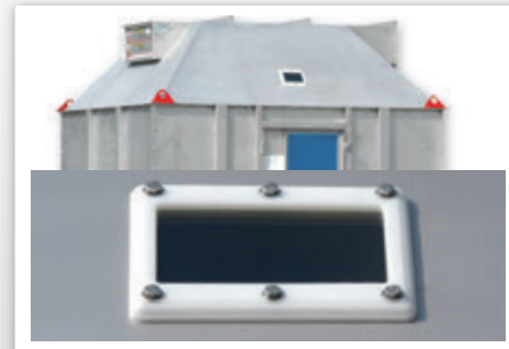
Inspection Ports [optional]