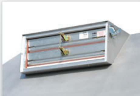
Air Damper [optional]